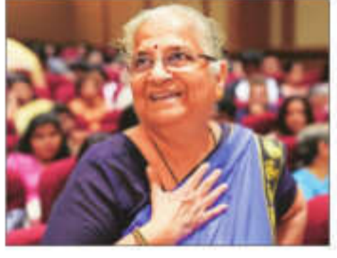
Announcing the nomination, Prime Minister Narendra Modi posted on X: "I am

The wife of Infosys co-founder Narayana Murthy, Sudha Murty is the mother-in-law of British Prime Minister Rishi Sunak.