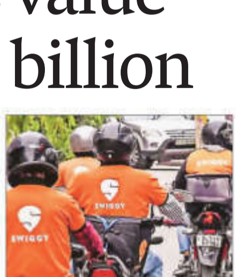
investment by 66.4% to $15.4 million as of December 31, from $45.9 million in the previous quarter. The asset manager had invested in the company in 2021 through two of its funds — Baron Global Advantage Fund and Baron Emerging Markets Fund.

Byju's markdown As for the troubled edtech firm Byju's, Baron Capital slashed the fair value of its