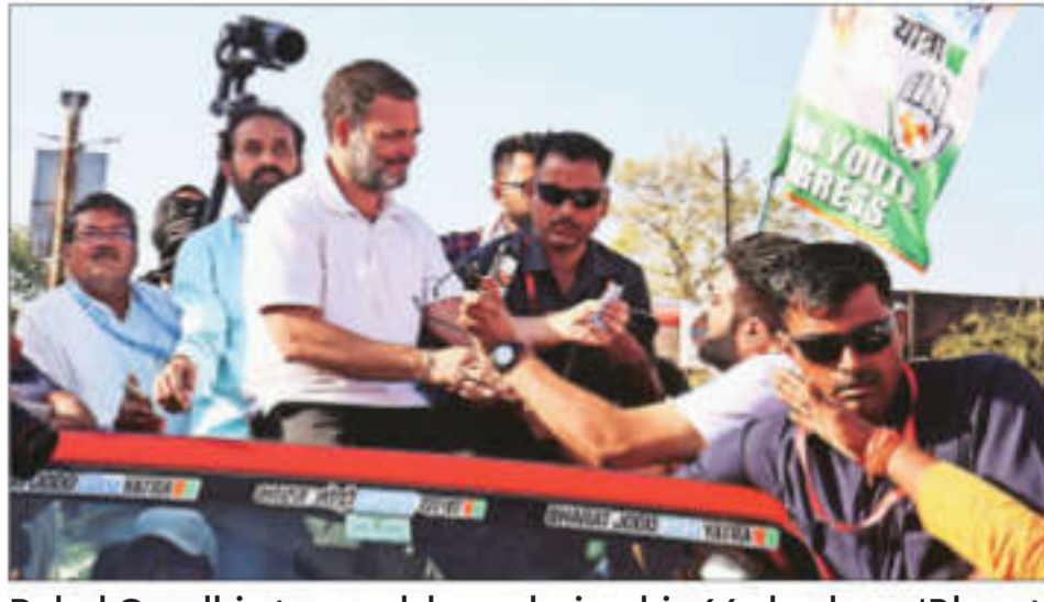
Rahul Gandhi at a roadshow during his 66-day long 'Bharat Jodo Nyay Yatra' in Gujarat's Halol on Friday