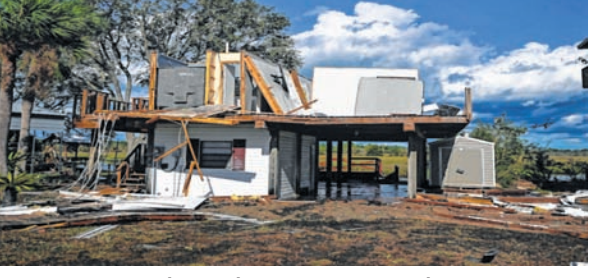
A destroyed house is seen in Keaton Beach, Florida on Wednesday after Hurricane Idalia made landfall

The remnants of Hurricane Idalia continued to barrel through the Southeast of the US, bringing heavy flooding even as US President Joe Biden declared a state of emergency for the state of South Carolina.