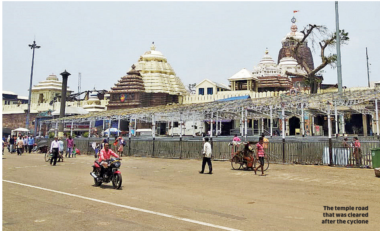
The temple road that was cleared after the cyclone

Though they have faced hardships since cyclone Fani walloped the town, the locals are hopeful the situation will improve gradually, and they will be able to watch the count-