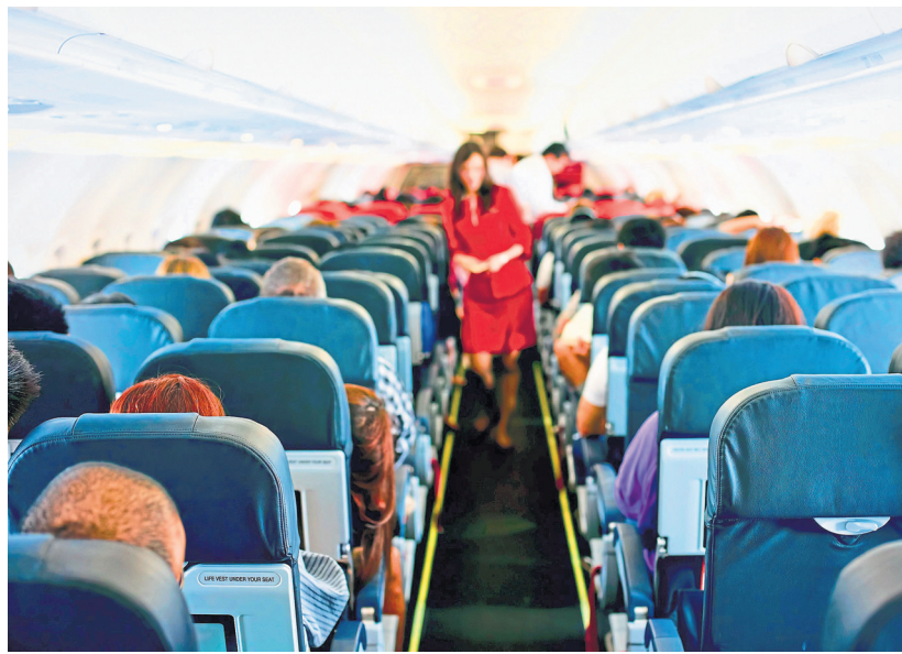
Thomas Cook said the US is popular for valid visa holders, while Dubai, Abu Dhabi, the Maldives and Sri Lanka are well-liked for special occasions and weekend getaways.

With countries easing border restrictions and India set to resume scheduled international flights from 15 March, travel companies expect a rush this summer. According to Thomas Cook India, travel operators have witnessed a fourfold rise in the number of queries in the past 15 days.