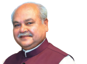
NARENDRA SINGH TOMAR

Sustainable agriculture is essential for ensuring that India achieves its national security goal for its 1.4 billion people. Under the guidance of Prime Minister Narendra Modi, the Ministry of Chemicals and Fertilizers took proactive initiatives to address the growing issue of imbalanced chemical fertiliser usage.