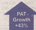
Figure above depicts consolidated result Q4, FY21-22 in comparison with Q4, FY20-21

Extract of Audited Consolidated and Standalone Financial Results for the Quarter & Year Ended March 31, 2022