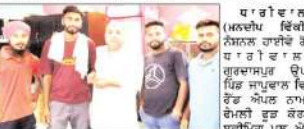
ਦਾਤਾ ਦੀ ਵੱਡੀ ਸਮਾਜਿਕ ਸੇਵਾਵਾਂ ਵਿੱਚ ਸ਼ਾਮਲ ਹੋਣ ਵਾਲੇ ਸਮੇਂ ਸਿੱਖਾਂ ਦੀ ਇਮਾਨਦਾਰੀ ਜ਼ਿੰਦਾ ਹੈ!

ਦਾਤਾ ਦੀ ਵੱਡੀ ਸਮਾਜਿਕ ਸੇਵਾਵਾਂ ਵਿੱਚ ਸ਼ਾਮਲ ਹੋਣ ਵਾਲੇ ਸਮੇਂ ਸਿੱਖਾਂ ਦੀ ਇਮਾਨਦਾਰੀ ਜ਼ਿੰਦਾ ਹੈ! ਇਸ ਸਮੇਂ ਸਿੱਖਾਂ ਦੀ ਇਮਾਨਦਾਰੀ ਜ਼ਿੰਦਾ ਹੈ! ਇਸ ਸਮੇਂ ਸਿੱਖਾਂ ਦੀ ਇਮਾਨਦਾਰੀ ਜ਼ਿੰਦਾ ਹੈ!