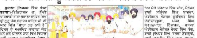
ਸਾਲਾਨਾ ਜੋੜ ਮੇਲ ਨੂੰ ਸਮਰਪਿਤ ਮਹਾਨ ਕਵੀ ਦਰਬਾਰ ਕਰਵਾਇਆ

ਸਾਲਾਨਾ ਜੋੜ ਮੇਲ ਨੂੰ ਸਮਰਪਿਤ ਮਹਾਨ ਕਵੀ ਦਰਬਾਰ ਕਰਵਾਇਆ। ਇਸ ਸਮੇਂ ਸਿੱਖਾਂ ਦੀ ਇਮਾਨਦਾਰੀ ਜ਼ਿੰਦਾ ਹੈ! ਇਸ ਸਮੇਂ ਸਿੱਖਾਂ ਦੀ ਇਮਾਨਦਾਰੀ ਜ਼ਿੰਦਾ ਹੈ!