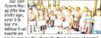
ਗੁਰੂ ਗੋਬਿੰਦ ਸਿੰਘ ਕਾਨਵੈਂਟ ਸਕੂਲ 'ਚ ਆਬਾਦੀ ਵਿਰਾੜਾ ਮਨਾਇਆ

ਗੁਰੂ ਗੋਬਿੰਦ ਸਿੰਘ ਕਾਨਵੈਂਟ ਸਕੂਲ 'ਚ ਆਬਾਦੀ ਵਿਰਾੜਾ ਮਨਾਇਆ। ਇਸ ਸਮੇਂ ਸਿੱਖਾਂ ਦੀ ਇਮਾਨਦਾਰੀ ਜ਼ਿੰਦਾ ਹੈ! ਇਸ ਸਮੇਂ ਸਿੱਖਾਂ ਦੀ ਇਮਾਨਦਾਰੀ ਜ਼ਿੰਦਾ ਹੈ!