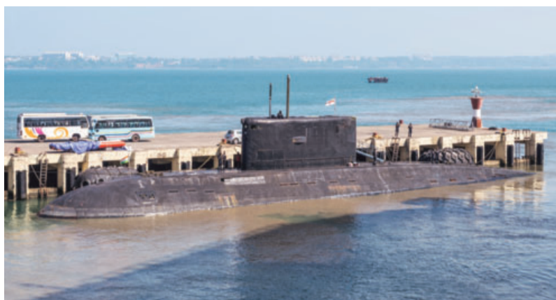
India needs larger submarines for the Bay of Bengal coast. These submarines will need to be nuclear powered, possessing the endurance to sail submerged to four crucial south-east Asian straits to block Chinese warships from entering the Indian Ocean from the South China Sea

The Pakistan-centric Project 75-I seeks six submarines for operations in the shallow