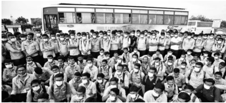
After it announced its exit in September 2021, Ford had set in motion a generous severance scheme for its 2,000 employees.

For Ford, this will mark its third exit from India. The first was in 1953, after import restrictions were imposed, and the second in 1995, when a joint venture with Mahindra & Mahindra (M&M) failed. Sources indicate that the India subsidiary is close to finding a buyer soon for its Chennai plant after it managed to sell its Sanand unit to Tata Motors for ₹725 crore in December last year. Several potential buyers, including MG Motors, Ola, (M&M), have visited the 25-year old site spread over 350 acres, which