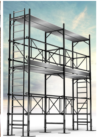
Stairs & Scaffolding