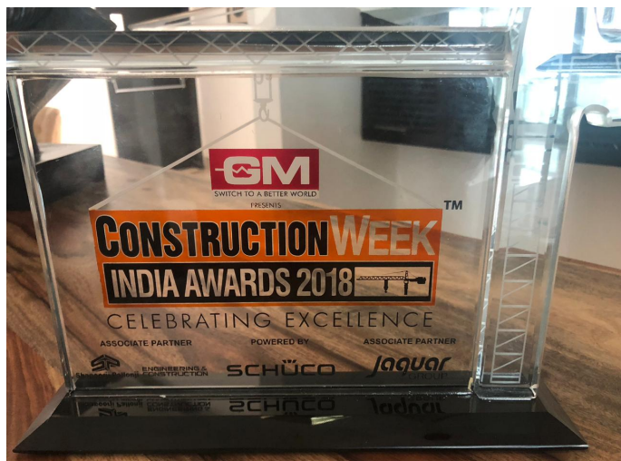
Infrastructure Company of the year