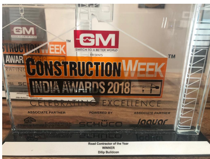
Road Contractor of the year