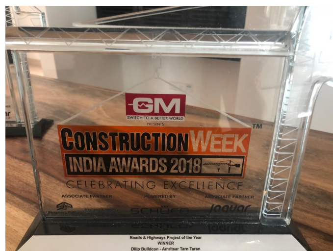
Roads & Highways Project of the year (Amritsar Taran Taran)