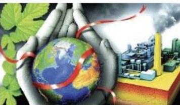
Power plants in category A can install the emission control equipment by December 31, 2022...