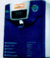
Naturflow 2,0 RO + UV + Alkaline Water Purifier