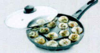
Omega Select Plus Paniyarakkal Non-stick Cookware