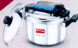
Flip-on Svachh Pressure Cooker