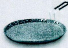
Durastone Hard Anodised Non-stick Cookware