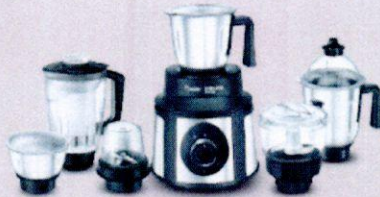
Endura Mixer - Knead, Chop, Mix, Grind and Store