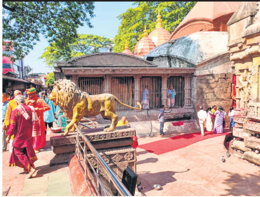
The Kamakhya Devi Temple is a place of worship for millions of Indian devotees

The connection between Maharashtra and Assam goes beyond the temple project. Sarma recalled that during the political rebellion in Ma-