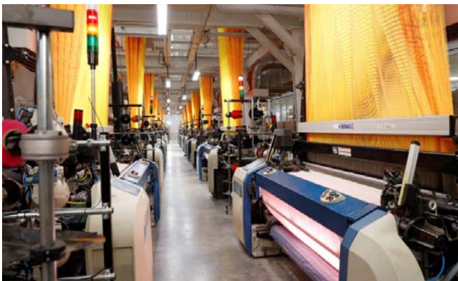
A view of Jacquard Looms installed in our Newly established Fabric Unit.