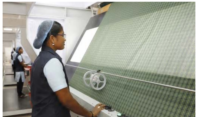
Superior Quality Fabrics produced in our Newly established Fabric Unit.