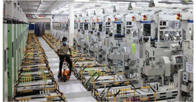
A view of most modern Ring Spinning Frames with link-coners installed at our Mills by replacing old machineries as a part of modernisation programme.