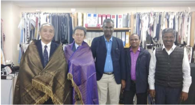
Our Executives meeting the customers during their visit to Japan.