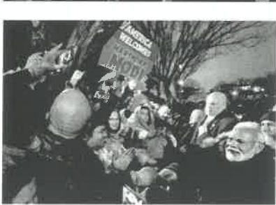
(Clockwise from top) PM Narendra Modi arrives in Washington DC on Thursday; He met the India diaspora gathered outside Blair House, the President's Guest House; Modi met US Director of National Intelligence Tulsi Gabbard