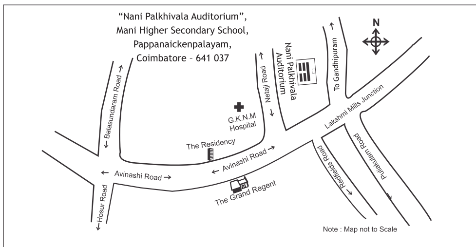
Route Map to the Venue of the AGM