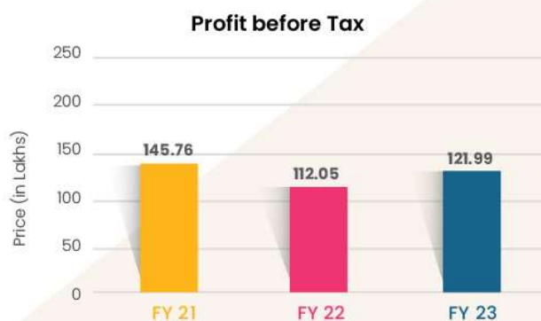
PBT at 121.99 for FY 2023