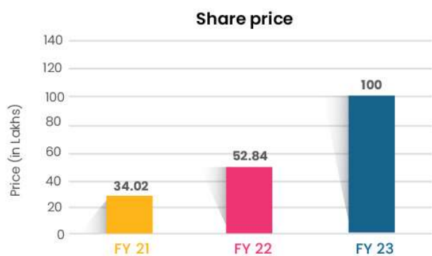
Wealth Generation/Share Price