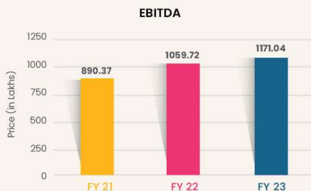
EBITDA at 154.39 for FY 2023