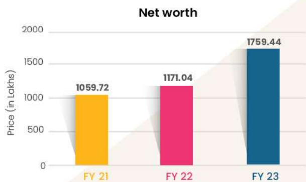
Net Worth is increased by 50.24 % Y-O-Y