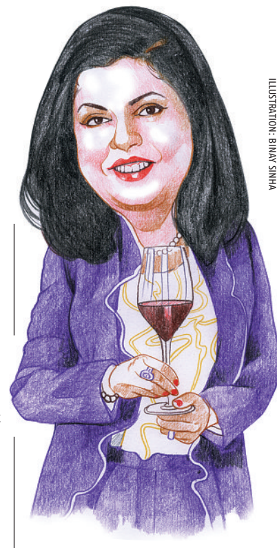
ILLUSTRATION: BHAVI SHARMA

Trained in hotel management, the naturally ambitious Holland sought a sunrise industry. The decision to venture into wine was