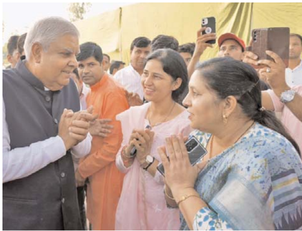
पूर्व प्रधानमंत्री चौ. चरण सिंह की 37वीं पुण्यतिथि पर किसान घाट पर श्रद्धांजलि देने पहुंचे उपराष्ट्रपति जगदीप धनखड़।

नई दिल्ली, (भाषा)। उपराष्ट्रपति जगदीप धनखड़ ने बुधवार को पूर्व प्रधानमंत्री चौधरी चरण सिंह की 37वीं पुण्यतिथि पर उन्हें श्रद्धांजलि अर्पित की। धनखड़ आज सुबह किसान घाट पहुंचे और वहां किसान नेता सिंह को पुष्पांजलि अर्पित की। उन्होंने कहा, चौधरी चरण सिंह ईमानदारी के प्रतीक थे। किसान, गरीब और गांव का उत्थान उनके दिल में रहता था। उनकी करनी और सोच में कोई फर्क नहीं था। उपराष्ट्रपति ने कहा कि जब उन्हें भारत रत्न दिया गया तो करोड़ों लोगों ने देश-विदेश में प्रसन्नता व्यक्त की। एक मुख्यमंत्री और प्रधानमंत्री के रूप में चरण सिंह की दूरदर्शी सोच की प्रशंसा करते हुए धनखड़ ने