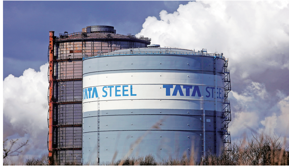
The company sold 5.42 million tonnes of steel in India, up from 5.15 million tonnes in the same quarter last year.

Tata Steel's consolidated revenue for the fourth quarter at ₹58,687 crore was 7% lower compared to the corresponding period last year. Analysts had estimated a revenue of ₹58,375