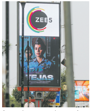
Streaming companies are also keen to avoid politico-cultural landmines.