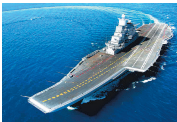
INS Vikramaditya, India's only aircraft carrier, which would be joined this month by the newly built INS Virat

A fortnight ago, an opinion column in this newspaper argued for the early construction of a second indigenous aircraft carrier (IAC-2) for the Indian Navy. The first indigenous carrier, IAC-1, which has been constructed by Cochin Shipyard Ltd, will soon be commissioned as INS Vikrant . Alongside INS Vikramaditya , which was bought from Russia in 2014, the Navy will then operate two 44,000-tonne carriers.