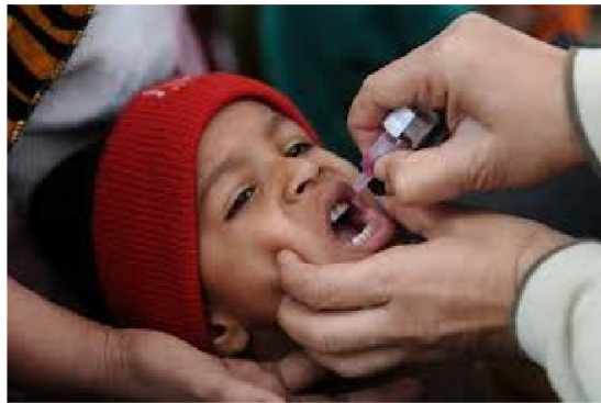
Eradication of Polio

BHARAT IMMUNOLOGICALS AND BIOLOGICALS CORPORATION LIMITED (A Government of India Undertaking) Registered Office: Vill. Chola, Distt. Bulandshahr (U.P.) - 203203