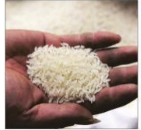
West Bengal, the biggest rice producer amongst states, has received deficient rainfall in 15 of its 23 districts, raising the likelihood of crop loss

This also comes amid a renewed debate on the freebie culture and the focus on the mounting dues of power distribution companies. According to latest government data, discoms of three states — Tamil Nadu, Maharashtra and Telangana — owed about 57% of total dues owed to power generating companies, followed by BJP-ruled Uttar Pradesh and Madhya Pradesh and the UTs of Jammu & Kashmir, which account for another about 26% of the total dues of ₹1,14,222 crore owed to power generation companies. Government data