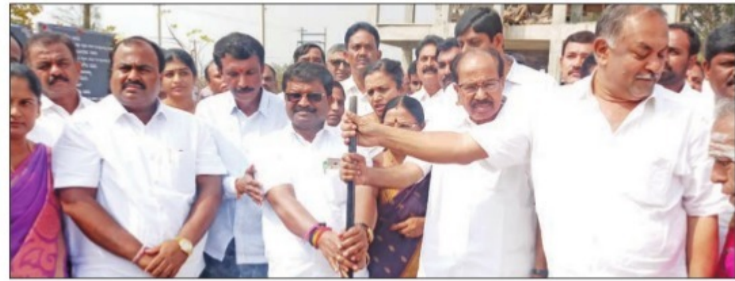
ದೇವನಹಳ್ಳಿ ಪಟ್ಟಣದ ವಿಜಯಪುರ ರಸ್ತೆಯಲ್ಲಿರುವ ಸರ್ಕಾರಿ ಸಾರ್ವಜನಿಕ ಆಸ್ಪತ್ರೆಯ ಆವರಣದಲ್ಲಿ 2018-19ನೇ ಸಾಲಿನ ನವಾಡ್ ಆರಂಭಿಸಿದ 23ನೇ ಯೋಜನೆಯಡಿ ಆಸ್ಪತ್ರೆಯನ್ನು ಮೇಲ್ದರ್ಜೆಗೇರಿಸಲು ಗುದ್ದಲಿ ಪೂಜೆ ನೆರವೇರಿಸಿದರು.

ಸಂ.ಕ.ಸಮಾಚಾರ ದೇವನಹಳ್ಳಿ ಸುಮಾರು 90 ಕೋಟಿ ರೂ. ವೆಚ್ಚದಲ್ಲಿ ಸರ್ಕಾರಿ ಆಸ್ಪತ್ರೆಯನ್ನು ಮೇಲ್ದರ್ಜೆಗೇ ಏರಿಸಲಾಗುವುದು ಎಂದು ಸಂಸದ ಎಂ.ವಿ.ಎ.ಪ್ರಜ್ಜೆಯವರು ತಿಳಿಸಿದರು.