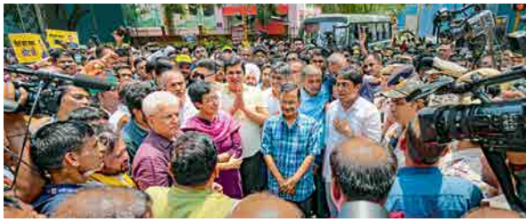
दिल्ली : आम आदमी पक्षाने भाजपविरुद्ध रविवारी दिल्लीत आवाज उठविला.