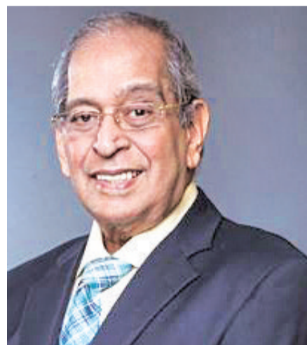
N Vaghul engaged stalwart thinkers from academia in the US to articulate a vision for ICICI as a large financial conglomerate

In 1994, it became obvious to Mr. Vaghul that ICICI's sustainability as a development financial institution was untenable. He engaged stalwart thinkers from academia in the US to articulate a vision for ICICI as a large financial conglomerate. He invited everyone in ICICI, from mid-management