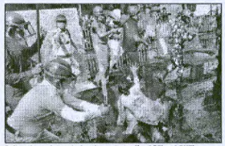
Police charge baton during the protest rally of SFI and DYFI that was organised against the govt in Kolkata on Thursday.