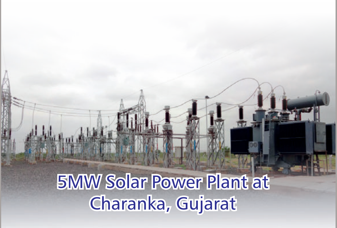
5MW Solar Power Plant at Charanka, Gujarat