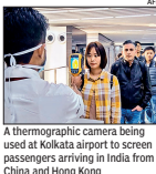
A thermographic camera being used at Kolkata airport to screen passengers arriving in India from China and Hong Kong

clare at port of arrival. Passengers on flights will need to fill up self-reporting forms before disembarkation, making these declarations, issuing a statement on Tuesday, the ministry of civil aviation (MoCA) has directed seven airports — Chennai, Bengaluru, Hyderabad, Cochin, Delhi, Mumbai and Kolkata — to set up health counsellors.