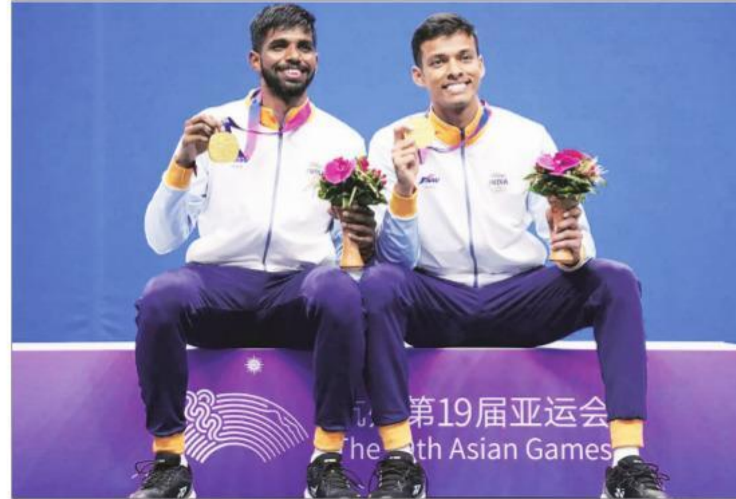
Satwiksairaj Rankireddy and Chirag Shetty after winning India's first-ever gold medal in badminton at the 2023 Asian Games

A 1.5-km access road to the top of the tunnel has already been built by the Border Roads Organisation (BRO) as the option of vertical drilling has been on the cards for some time.