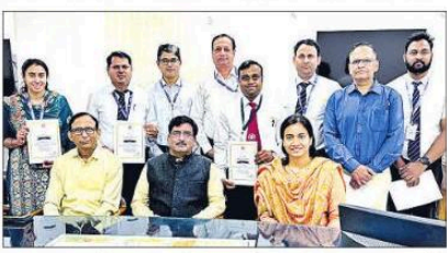
पुरस्त्रित हुआ टिकट चेकिंग स्टाफ डीआरएम के साथ।