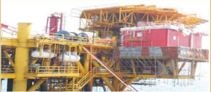
Topside Installation, modification / Hook up, Commissioning and Fabrication