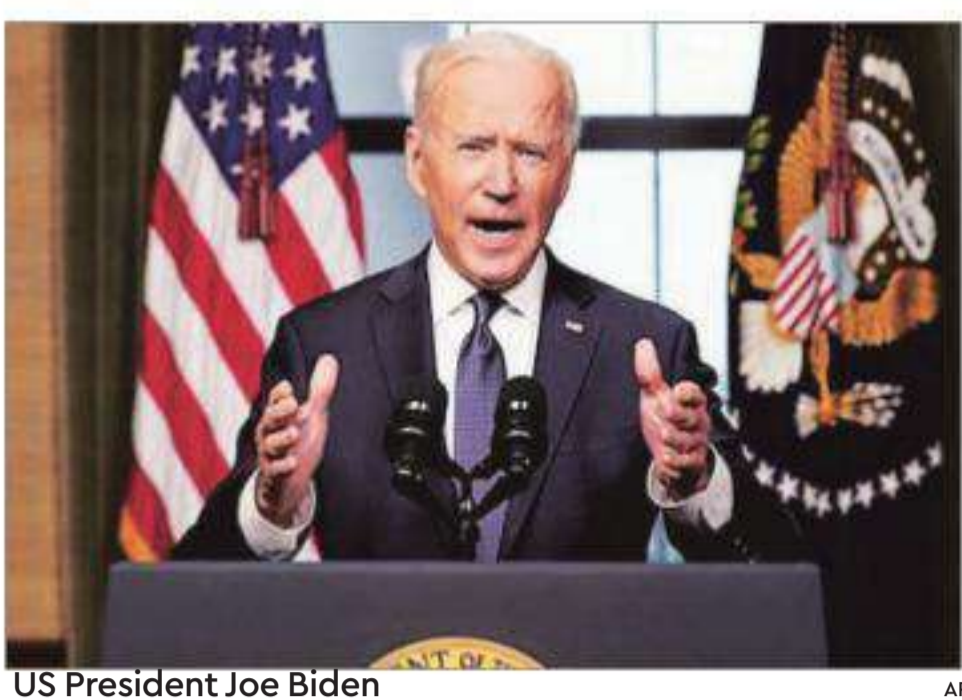
US President Joe Biden