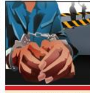
जगतपुरी इलाके की वारदात, बाइक के नंबर प्लेट की एक डिजिट को बदला हुआ था, फोन बरामद

इसी दौरान किसी का कॉल आया तो उन्होंने फोन कान पर लगाया। बाइक के पीछे बैठे