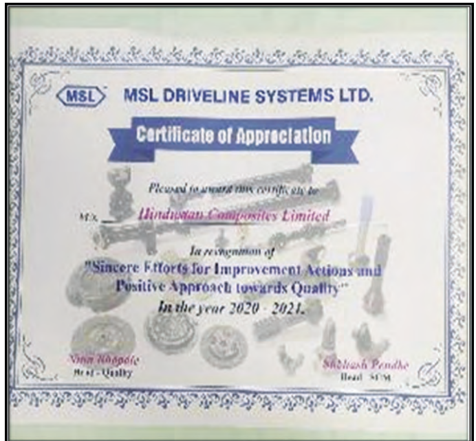
Award from MSL Driveline for Product improvement and quality