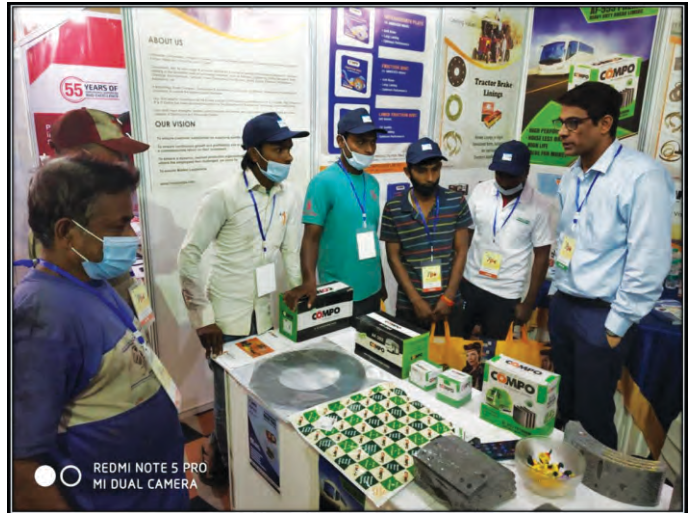
Our participation at ACMA Expo at Guwahati in December, 2021