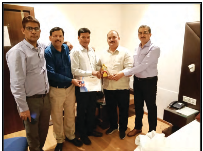
Recognition to Sales (aftermarket) Achievers in the year 21-22