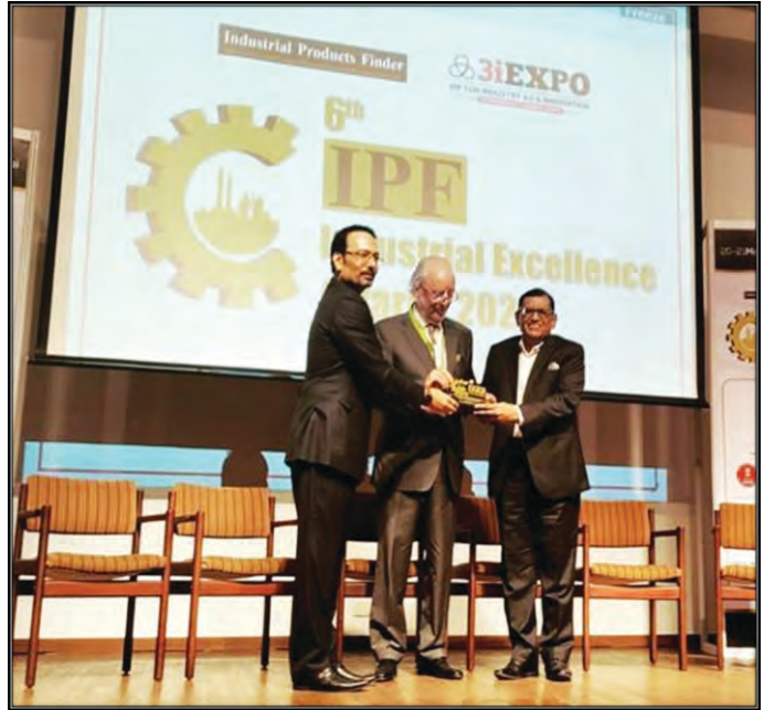
Fastest Growing Company (Medium –Auto Ancillary) awarded by IPF Industrial Excellence