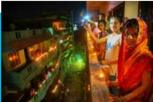
Kept India's electrical grid stable during the 'Light's off event on 5th April.