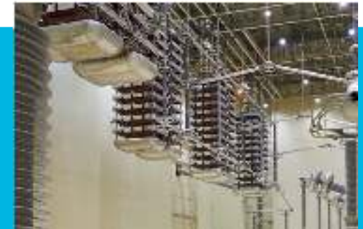
Commissioned the final pole of the Champa-Kurukshetra (CK) HVDC project