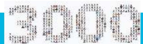
Safety continues to be of paramount importance to us. Our plant at Pallavaram achieved an important milestone of 3000 safe man-days on 27 May 2020, this is equivalent to 19.03 Million Man hours.