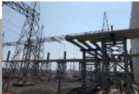
Commissioned 6 bays 400 kV for TPL A/c at Ramagundam