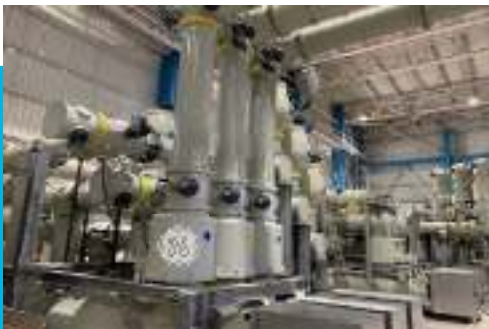
Commissioned 220/132/33 kV AIS for BSPTCL at Supaul