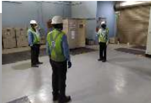
Uninterrupted delivery of power supply at Delhi & Chennai airport