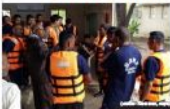
(પહોંચી) ભરૂચ ખાતે એસ. ડી. આર. એફની ટીમ તહેનાત માટે તૈયાર કરવામાં આવેલા સભ્યો સાથે એસ. ડી. આર. એફની ટીમના સભ્યોની તૈયારી.

વા. સરકારી વહીવટી તંત્ર સજ્જ કરવામાં આવેલા સભ્યો સાથે એસ. ડી. આર. એફની ટીમ તહેનાત માટે તૈયાર કરવામાં આવેલા સભ્યો સાથે એસ. ડી. આર. એફની ટીમના સભ્યોની તૈયારી.