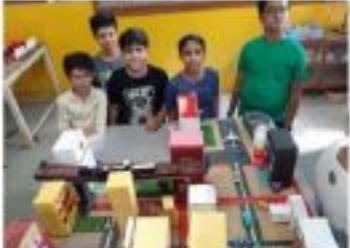
અમદાવાદની સ્કૂલના વિદ્યાર્થીઓ દ્વારા નવો પ્રોજેક્ટ રજૂ કર્યો.