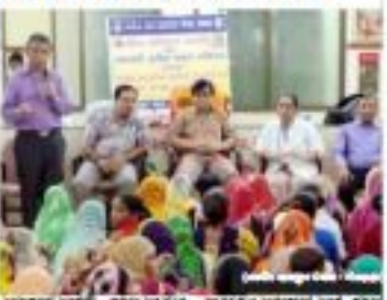
ખેડહિાના દેરોલ ખાતે પ્રધાનમંત્રી સુરક્ષિત માતૃત્વ અભિયાન અંતર્ગત ઉજવણી કરવામાં આવી.

(પહોંચી) ખેડહિાના દેરોલ ખાતે પ્રધાનમંત્રી સુરક્ષિત માતૃત્વ અભિયાન અંતર્ગત ઉજવણી કરવામાં આવી.