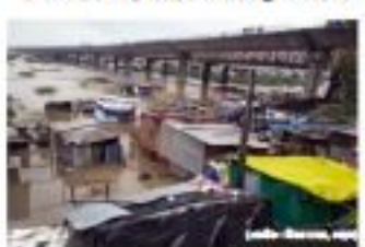
(પહોંચી) ભરૂચ ખાતે ગોલ્ડન ક્રિજ પર નર્મદા નદીની જળસપાટીમાં વધારો થતા સ્થળાંતર માટેની કામગીરી હાથ ધરાઈ.