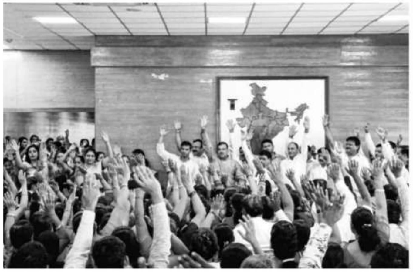
52 corporators of NCP along with supporters join BJP during a programme in Navi Mumbai on Tuesday

48-hr Orange... These activities are likely to continue till August 2 and would be accompanied by local flooding in parts of Madhya Pradesh, said Met department. One after the other Low-Pressure Areas are likely to be formed keeping the Monsoon rains active over these states in coming day, said the department official.