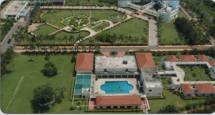
Jawaharlal Nehru Pharmacy Visakhapatnam