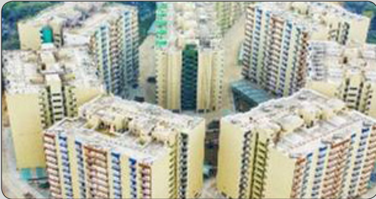
Largest Housing Society Signature Greens, Kanpur, UTTAR PRADESH