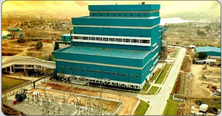
24 MW Waste to Energy Plant, Delhi