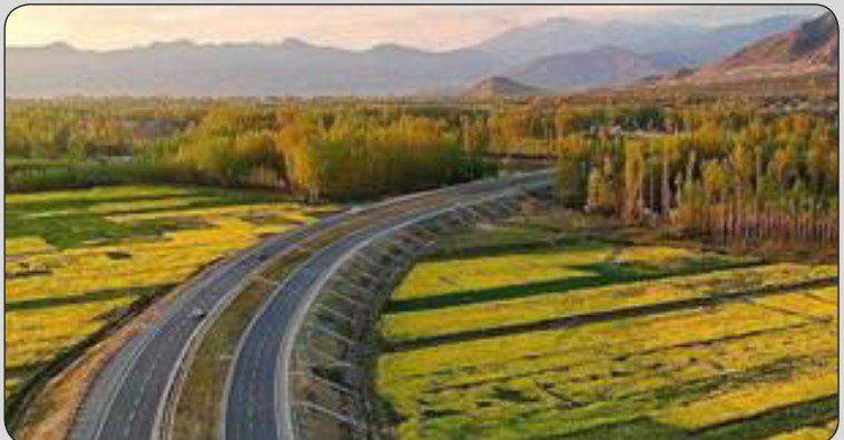
Srinagar Banihal Expressway, Srinagar