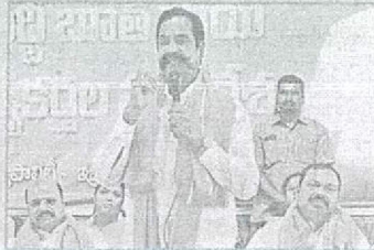
ఇటీవల విజయవాడలో జరిగిన కార్యక్రమంలో విద్యార్థులు పాల్గొన్నారు.

కర్ 25 (ఆంధ్రజ్యోతి): శిల్పకళా విద్యార్థులను, సభిత్వం ద్వారా బాంధవ్యం నిర్మించే ప్రయత్నం చేస్తున్నారని తెలుసుకున్నాం. వారు ప్రస్తుతం 'బంధం' అనే ప్రయోగంలో భాగంగా 'నిర్మించుకోవడం' అనే అంశంపై పనిచేస్తున్నారు.