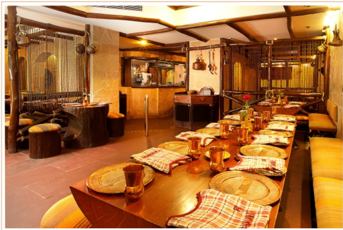
Peshawri - Speciality restaurant offering North-West Frontier cuisine