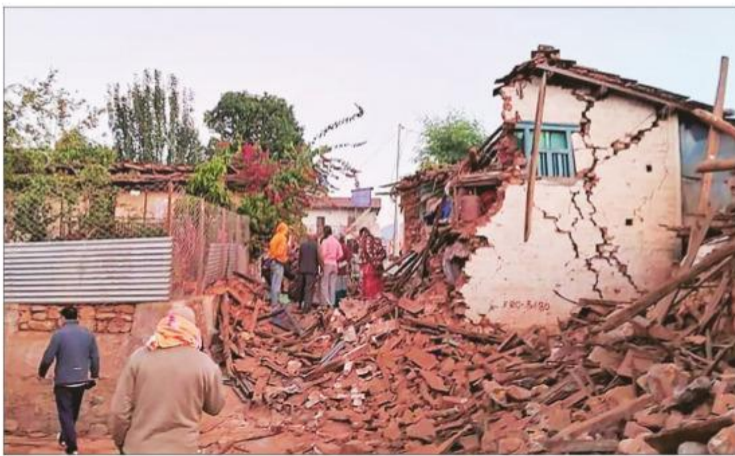
Villagers stand in front of their houses in Jajarkot damaged by the strong earthquake that hit the northwestern part of Nepal just before midnight Friday

Prime Minister Pushpakamal Dahal 'Prachanda' on Saturday toured the quake-hit region with a medical team. During the