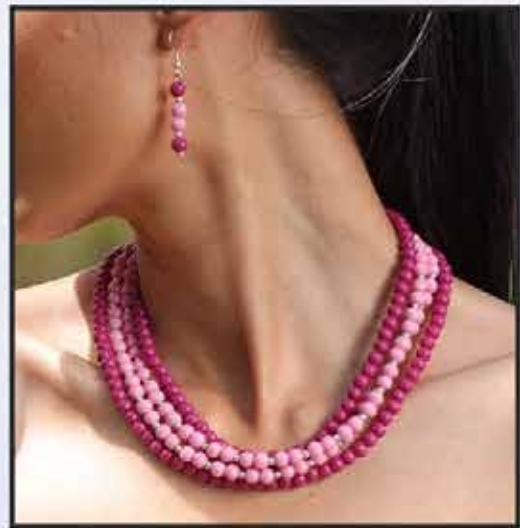
Finished Products from the house of BBL