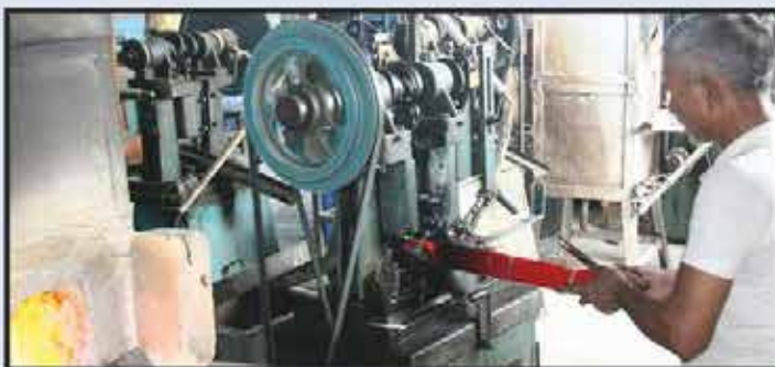
Making Press Beads from Semi Automatic machines