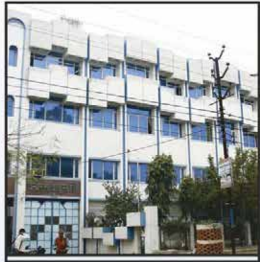
Corporate & Head Office in Varanasi