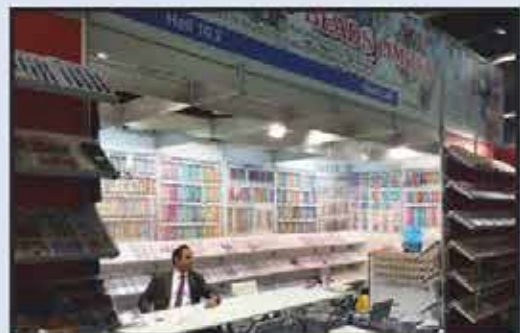
From Time to Time Company will participate Jewelry Fairs in various parts of worlds.