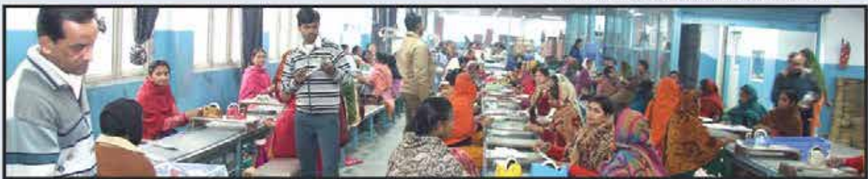
Production and Packaging Team do hard to serve best to our customers.