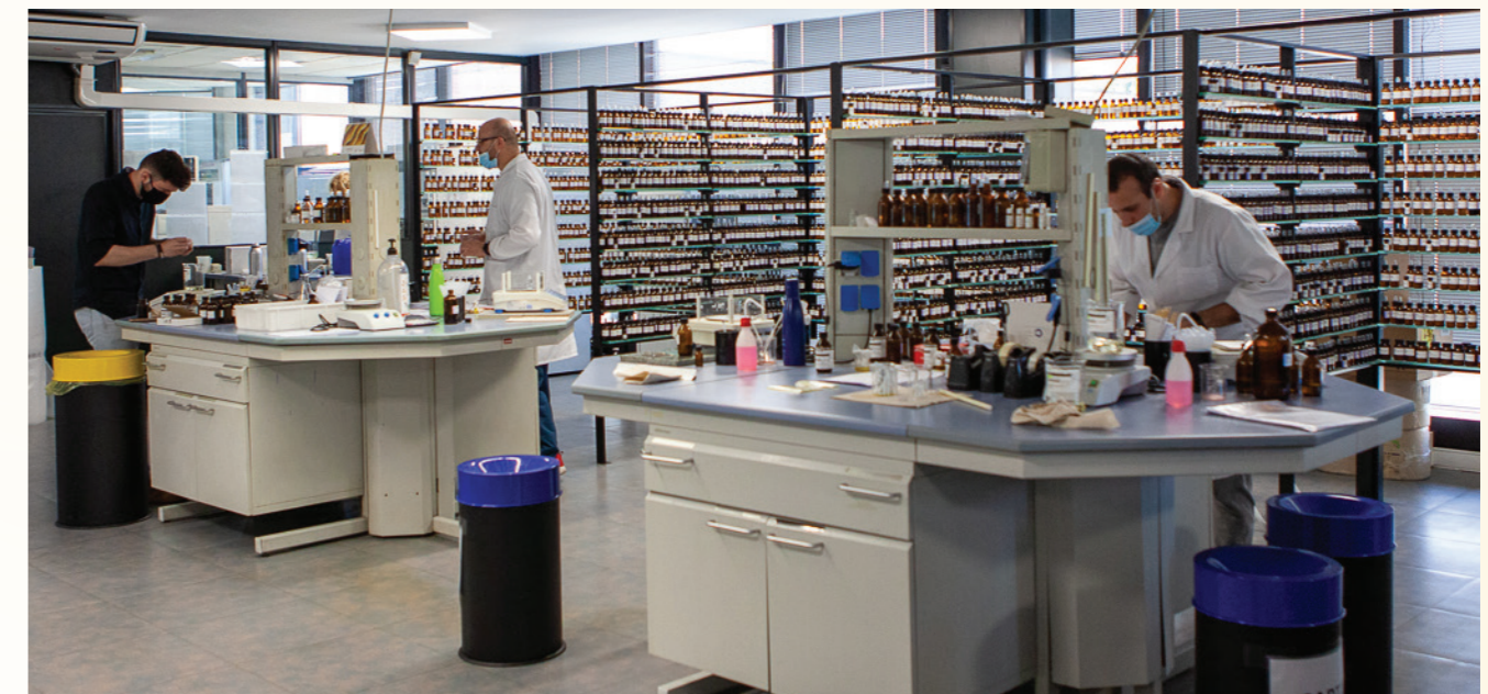
Fragrance Laboratory at Creative Flavours and Fragrances Spa, Italy

The Indian fragrances and flavours industry is considered one of the fastest growing industries globally and a significant competitor to China in terms of exports. However, due to the