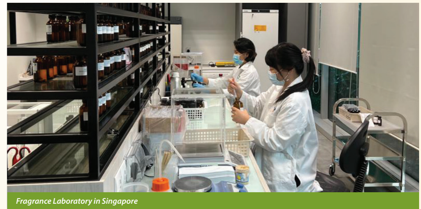
Fragrance Laboratory in Singapore

Mitigation: The Company strives to reduce defaults through robust critical screening of trade partners and strict adherence to defined processes. Appropriate credit insurance further enables to mitigate receivables risk.