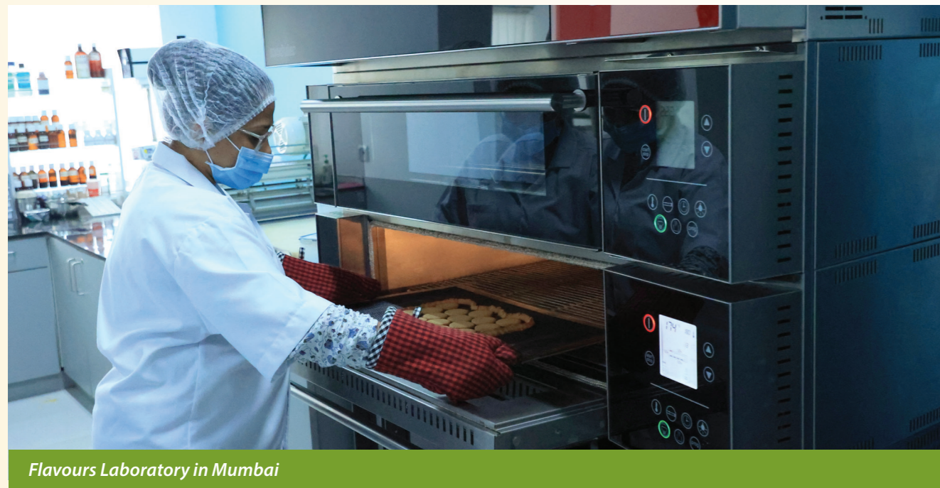
Flavours Laboratory in Mumbai

The pandemic has hastened the trend. The Company has been tracking these trends and behaviour and observes that pandemic has only enhanced consumer expectations and brought in behavioural changes faster. This bodes well for the growth prospects of the Company. The Company continues to remain focussed on the regional and local brands and specifically looking for niche opportunities which will benefit in the long-term growth.