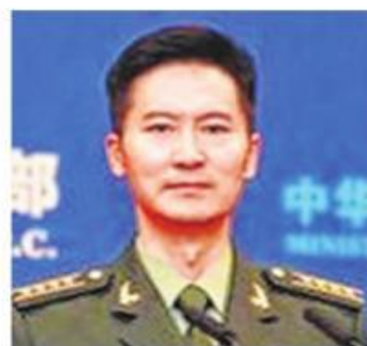
General rounds of talks at the diplomatic and military-level to resolve the standoff that erupted in early May.