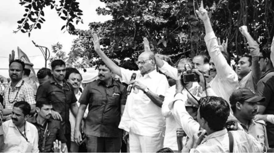
NCP Chief Sharad Pawar addresses supporters, in Maharashtra's Karad on Monday

Some in Opposition parties were sceptical of claims that Pawar senior and daughter Supriya Sule had little inkling of what party leaders Ajit