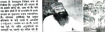
डेरा प्रमुख का एक कदम राजनीतिक दबदबा के लिए डेरा प्रमुख का ये बड़ा कदम।

हरियाणा विधान सभा में डेरा प्रमुख का एक कदम राजनीतिक दबदबा के लिए डेरा प्रमुख का ये बड़ा कदम।