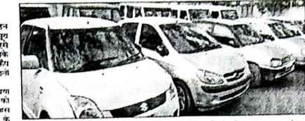
अगली कैटेगरी के गाड़ों को खरीदना मुश्किल हो जाएगा और नए गाड़ों को खरीदने में भी मुश्किल पड़ेगी।

पंजाब में अब लोगों के लिए पुराने गाड़ों को रखना मुश्किल हो जाएगा और नए गाड़ों को खरीदने में भी मुश्किल पड़ेगी।