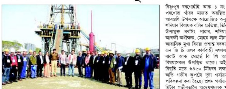
এজন বাতৰি দিওঁতা দুলীয়াজান, ১০ ফেব্ৰুৱাৰীঃ অহল ইণ্ডিয়া লিমিটেডে যোৱা তিনি ফেব্ৰুৱাৰীত

দুসৈহাসিক ক্ৰীড়া পোৰাগ্ৰহীণীৰ সময়ত স্বাস্থ্য পৰীক্ষাকে আদি কৰি সুসংৰক্ষিত বাবে ল'বলগীয়া কোনো ব্যৱস্থাই কৰা হোৱা নাছিল।