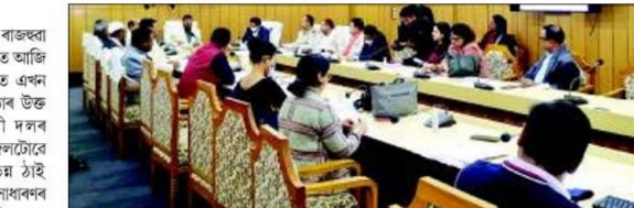
জিলাখনত লোক নিৰ্মাণ বিভাগৰ কামোৰা বিভিন্ন স্থানত অসমপুৰ হোৱাৰ কথা উল্লেখ কৰি এই সমৰ্থত জিলা প্ৰশাসনৰ তন্ত্ৰ কৰিব নিৰ্দেশ দিছে।

নিজা বাতৰি দিওঁতা ওদালগুৰি, ১০ ফেব্ৰুৱাৰীঃ বিধানসভাৰ ৰাজহুৱা হিচাপ সমিতিৰ প্ৰতিনিধি দলৰ উপস্থিতিত আজি ওদালগুৰি জিলা উপায়ুক্তৰ সভাকক্ষত এখন গুৰুত্বপূৰ্ণ সভা অনুষ্ঠিত হয়।