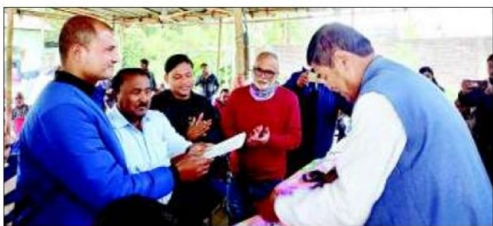
ৰাজ্যৰ বিৰিলাক পৌৰসভাত চি পি আই এমৰ সংগঠন আছে তাতেও কংগ্ৰেছ, অসম জাতীয় পৰিষদৰ লগতে ধৰ্মনিৰপেক্ষ দলসমূহৰ সৈতে মিত্ৰতাৰে পৌৰ নিৰ্বাচনত অৱতীৰ্ণ হ'ব।