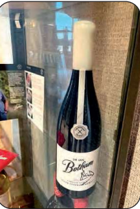
বিকি বারে ইয়ান বথামের নামাঙ্কিত ওয়াইন বটল।