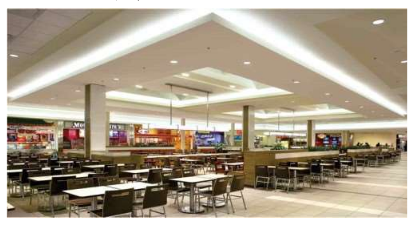
It comprises of 5 Screen multiplex, 18000 sqft. of Foodcourt, 44000 sqft. of Anchor store.

Third floor dedicated for presence of a large food court along with fine dining and entertainment options. Reserved areas for cafes, bars, specialty restaurants and food kiosks all over the mall.