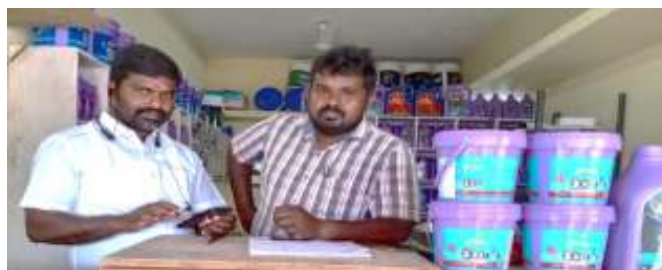
Bizom - Sales Force Automation driving Sales Team to engage with dealers. BTL activations for IPOL and Repsol in field conducted by our inspired team. Brand display at a dealer outlet.