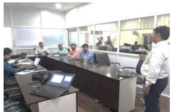
Product Presentation ACT24 series with Industrial customers. RPO engagement at All India Rubber Associations seminar